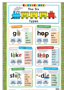
Six Syllable Types