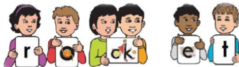
Syllable Types and Vowel Recognition